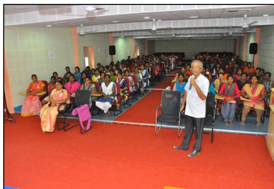
A National Seminar on “Nano-world” organised by the School of Physical Sciences on 23 rd January 2020