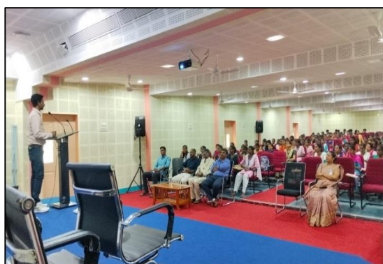
International Seminar on “Recent Trends and Advances in Chemical Sciences” organised by the Department of Chemistry on 7 th March 2024