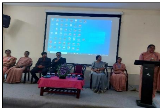
A State level Seminar on “Exploring the Horizons for Enthralling Career for Science Enthusiasts” organised by Department of Botany on 19 th October 2023