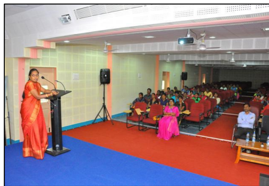
A National Seminar on “Artificial Intelligence in Agriculture” organised by the Department of Botany on 25 th February 2020