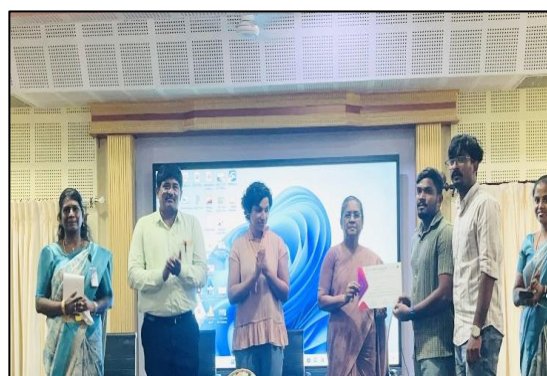
International Seminar on “HR with a Heart” jointly organised by the Department of Zoology, Department of Psychology and Department of MHRM on 21 st August 2024