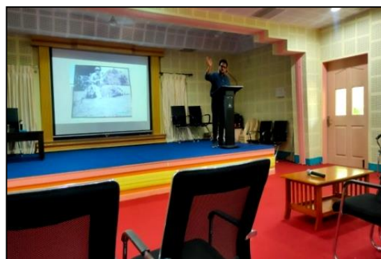
A National Seminar on “Farming and Floral Foot Prints - Tracing Interwoven Historical and Botanical Heritage” organised by Department of Botany in association with the Department of History, St. Mary's College (Autonomous), Thoothukudi on 27 th March 2024