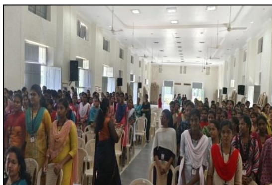
A National Seminar on “Intersecting Vistas: The Fusion of Landscape Aesthetics and Literature of the Human Ecology” organised by Department of Botany in association with Department of English on 25 th March 2024