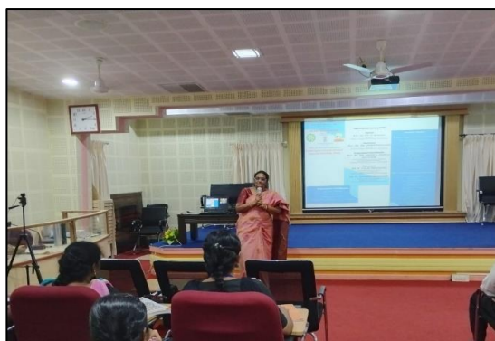
National Conference on “Exploring the Frontiers of Smart Materials [NCEFSM-2024]” organised by the Department of Physics on 15 March 2024