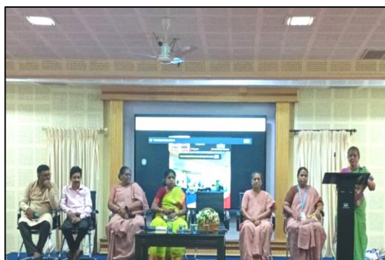
An International Seminar on “Perception of Zoological Research Through Tamil Literature” jointly organised by the Department of Zoology and Department of Tamil on 6 th September 2024