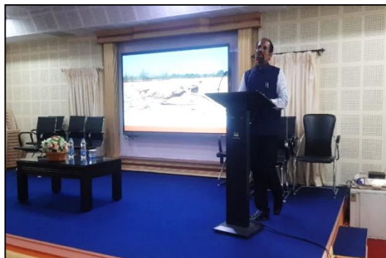
National Seminar on “Integrating Environmental Social Governance Strategies for Business Success” organised by the Department of Botany in association with Department of Commerce on 11 th September 2024