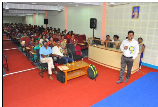
An International Conference on “Advanced Materials” organised by the School of Physical Sciences on 30 th and 31 st January 2020