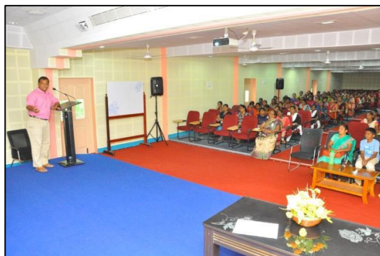
A Seminar on “Electrochemical Technology” organised by the Department of Chemistry on 13 th December 2019