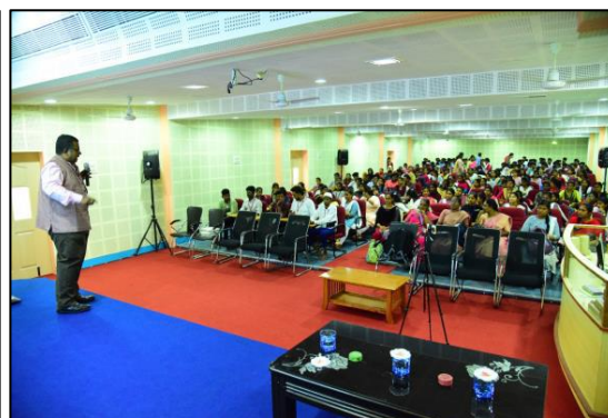
International Conference on “Exploring the Intersection of Stem Cells Research and Career Skills - A Global Perspective” organised by the Department of Botany in association with Department of Microbiology on 3 rd September 2024