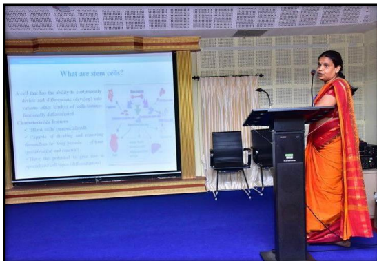
National Conference on “Recent Trends in Life Sciences” organised by the Department of Zoology on 17 th March 2023 and 18 th March 2023