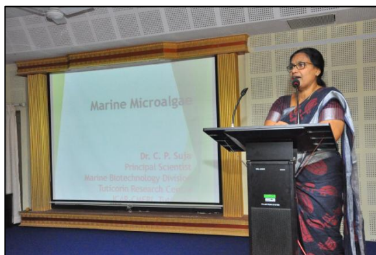
A Seminar on “Marine Biology” organised by the School of Biological Sciences on 20 th December 2019