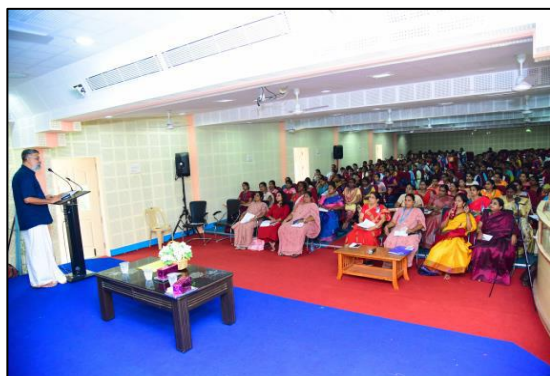
National Seminar on “Narratives of Nature: Exploring the Indigenous Ecology and Environmental ethics” organised by the Department of Botany in association with Department of English on 9 th September 2024