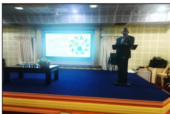
International Seminar on Tamilum Thavaramum ("தமிழும் தாவரமும்") organised by the Department of Botany in association with Department of Tamil on 10 th September 2024