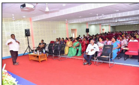
National Seminar on “Marine Resources: Conservation and Sustainable Utilization Strategies” organised by the Department of Zoology on 6 th March 2024