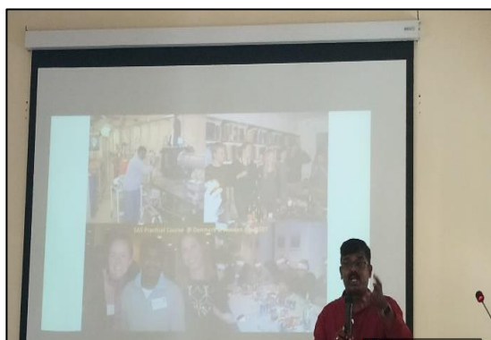
A National Seminar on “Interdisciplinary Research” organised by the Department of Zoology on 18 th September 2024