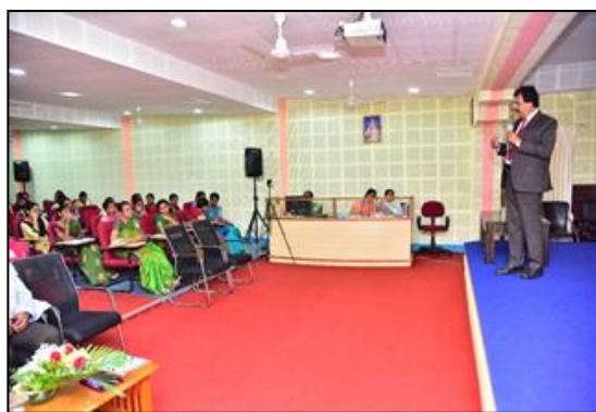
International Conference on “Microalgae: Biodiversity and Bioprospecting” organised by Department of Botany on 20 th and 21 st February 2024