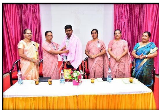
International Symposium on “Smart Materials” organised by the Department of Chemistry on 18 March 2023